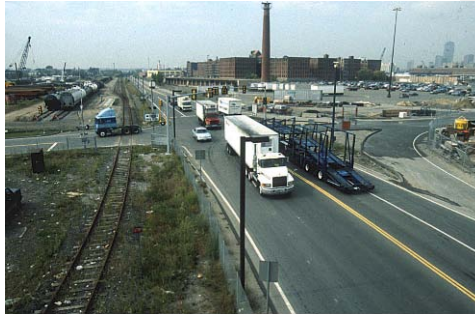
Figure 3: South Boston Bypass Road

There are a number of states studying the feasibility of truck-only lanes including Florida, California, and Georgia. Additionally, a national study conducted by the Reason Institute looks at a national truck-only system and a short list of corridors for pilot project implementation. This section highlights some of these studies.