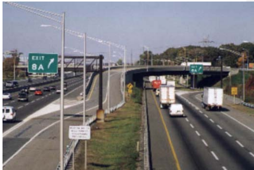
Figure 2: NJ Turnpike Dual-Dual Truck Lane