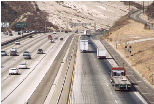
Figure 1: I-5 Truck Bypass, California (I-5/ SR-14/ I-210 Int.)