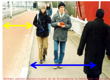
Willemsbrug Rotterdam, Netherlands 6' sidewalks (2) 6' bike lanes (2) Total: 24'