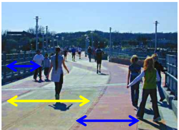
Pfluger Bridge Austin, TX 10' bi-directional bike path (1) 5' sidewalks (2) 15' observation deck Total: 20'