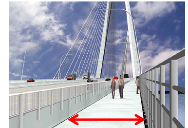
Cooper River Bridge Charleston, SC 12' shared-use path (1) Total 12'