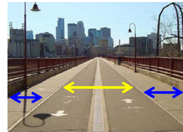
Stone Arch Bridge Minneapolis, MN Bi-directional bike path (1) Sidewalks (2) Total: 24'