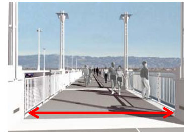
New Bay Bridge SF/Oakland, CA 15.5' shared-used path (1) 7.5' belvederes (2) Total 15.5'