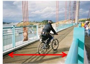
Carquinez Bridge Vallejo, CA 12' shared-use path (1) Total 12'