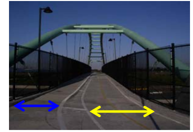
I-80 Ped/Bike Bridge Berkeley, CA 8' bi-directional bike path (1) 5' sidewalk (1) Total: 13'