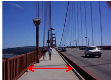
Golden Gate Bridge San Francisco, CA 10' shared-use path (1 full-time) 10' (5' clear) bike path (weekend) 1' raised above roadway Total 10' (15' weekend)