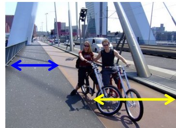
Erasmusbrug Rotterdam, Netherlands 6' sidewalks (2) 6' bike lanes (2) Total: 24'