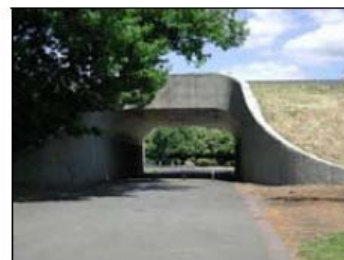
Underpass at Old Apple Tree Park