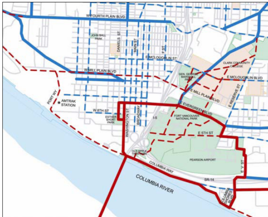
Figure III-4: Project 3, Discovery Loop / Central City

This project includes the Discovery Historic Loop and other trail segments that are in the central city area of Vancouver. The recently completed Discovery Historic Loop offers many historic and scenic attractions along the 2.3-mile trail. The Loop begins on East Evergreen and winds through Fort Vancouver National Historic Site, Officer's Row, and downtown Vancouver, joining the Waterfront Renaissance Trail at Vancouver Landing. Sights along the way include Fort Vancouver, Pearson Air Museum, Providence Academy and Esther Short Park. Although construction of the trail is complete, a number of trail amenities such as benches and signage are recommended to realize the full potential of the Loop. Additionally, a connection with the Amtrak station and a land bridge through Old Apple Tree Park are recommended to create a larger loop connecting this path with the Columbia River and central city areas. The numbering of segments in this section starts with the Discovery Loop and then runs from south to north beginning at I-5 and the Columbia River.