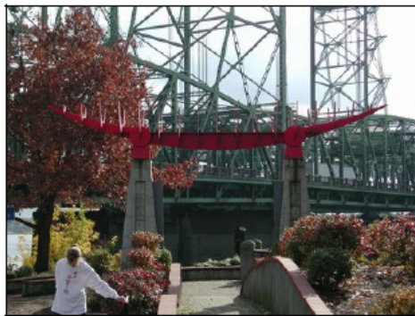
Public art at the waterfront