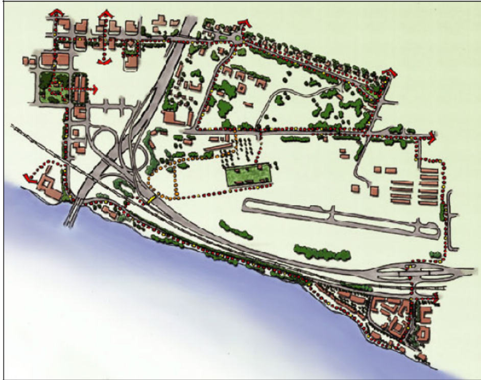
Vancouver's Discovery Historic Loop