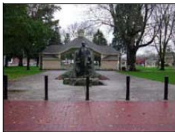
Pioneer Mother statue