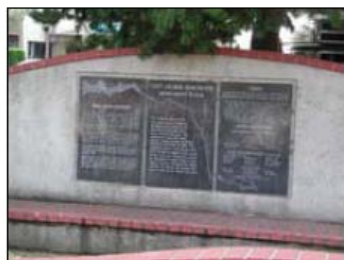
Capt. Vancouver Plaza sign