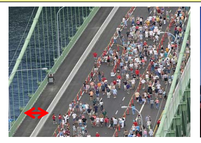
Tacoma Narrows Bridge Tacoma, WA