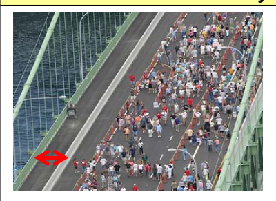
Tacoma Narrows Bridge Tacoma, WA