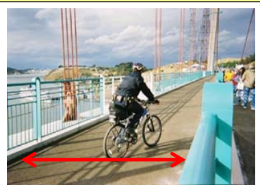
Carquinez Bridge Vallejo, CA

10' shared-use path (1 full-time) 10' (5' clear) bike path (weekend) 1' raised above roadway Total 10' (15' weekend)