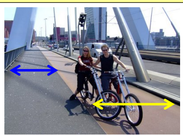
Eramusbrug Rotterdam, Netherlands

6' sidewalks (2) 6' bike lanes (2) Total: 24'