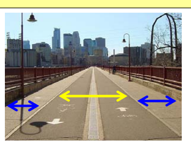
Stone Arch Bridge Minneapolis, MN

6' sidewalks (2) 6' bike lanes (2) Total: 24'