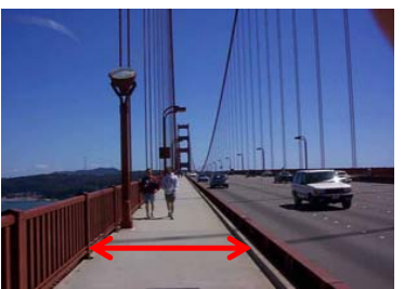
Golden Gate Bridge San Francisco, CA

10' shared-use path (1 full-time) 10' (5' clear) bike path (weekend) 1' raised above roadway Total 10' (15' weekend)