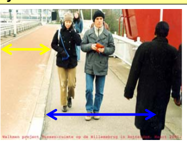
Willemsbrug Rotterdam, Netherlands

10' bi-directional bike path (1) 5' sidewalks (2) 15' observation deck Total: 20'