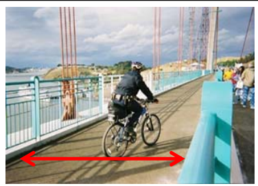
Carquinez Bridge Vallejo, CA

10' shared-use path (1 full-time) 10' (5' clear) bike path (weekend) 1' raised above roadway Total 10' (15' weekend)