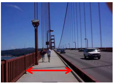
Golden Gate Bridge San Francisco, CA

10' shared-use path (1 full-time) 10' (5' clear) bike path (weekend) 1' raised above roadway Total 10' (15' weekend)