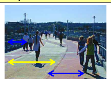
Pfluger Bridge Austin, TX

10' bi-directional bike path (1) 5' sidewalks (2) 15' observation deck Total: 20'