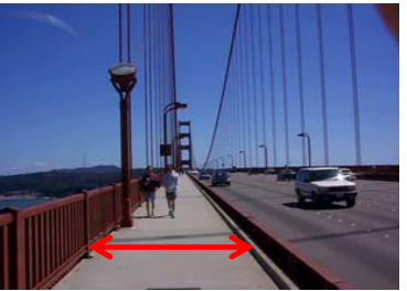
Golden Gate Bridge San Francisco, CA

10' shared-use path (1 full-time) 10' (5' clear) bike path (weekend) 1' raised above roadway Total 10' (15' weekend)