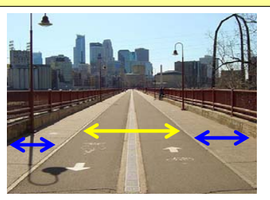
Stone Arch Bridge Minneapolis, MN

6' sidewalks (2) 6' bike lanes (2) Total: 24'