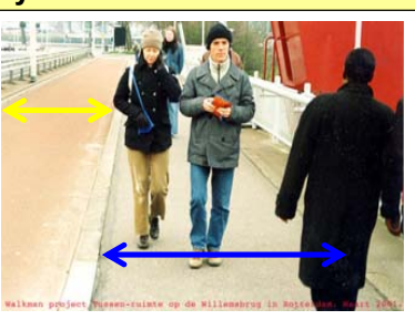
Willemsbrug Rotterdam, Netherlands

10' bi-directional bike path (1) 5' sidewalks (2) 15' observation deck Total: 20'