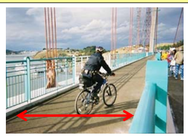
Carquinez Bridge Vallejo, CA

10' shared-use path (1 full-time) 10' (5' clear) bike path (weekend) 1' raised above roadway Total 10' (15' weekend)