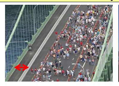
Tacoma Narrows Bridge Tacoma, WA