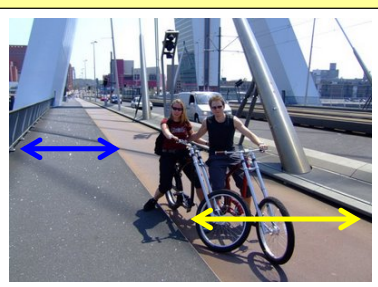
Eramusbrug Rotterdam, Netherlands

6' sidewalks (2) 6' bike lanes (2) Total: 24'