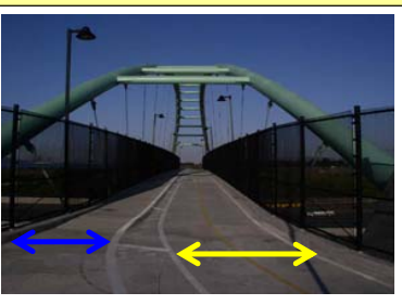
I-80 Ped/Bike Bridge Berkeley, CA

Bi-directional bike path (1) Sidewalks (2) Total: 24'