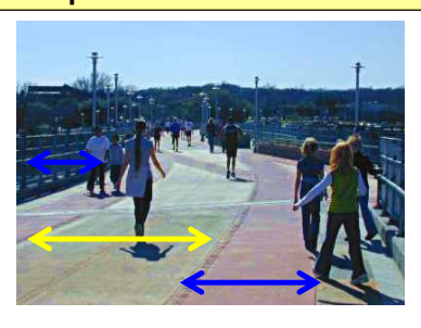
Pfluger Bridge Austin, TX

10' bi-directional bike path (1) 5' sidewalks (2) 15' observation deck Total: 20'