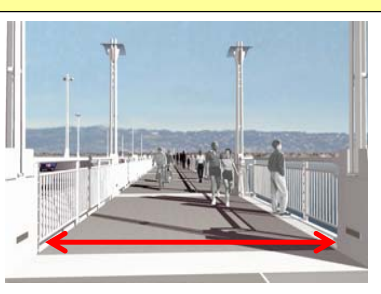
New Bay Bridge SF/Oakland, CA

15.5' shared-used path (1) 7.5' belvederes (2) Total 15.5'