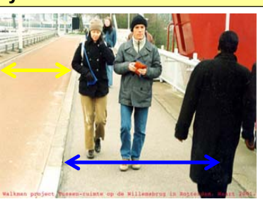
Willemsbrug Rotterdam, Netherlands

10' bi-directional bike path (1) 5' sidewalks (2) 15' observation deck Total: 20'