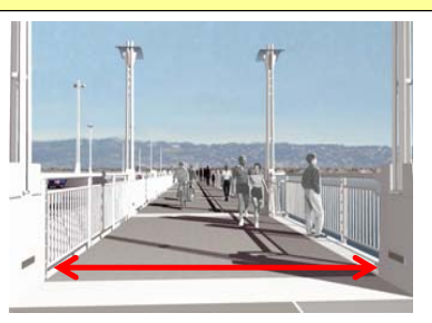
New Bay Bridge SF/Oakland, CA

15.5' shared-used path (1) 7.5' belvederes (2) Total 15.5'