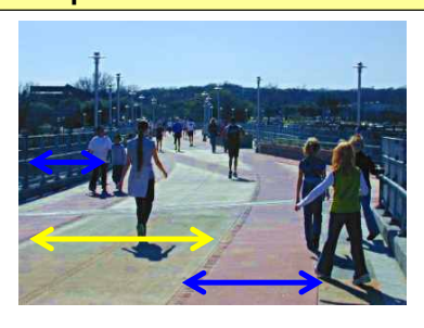
Pfluger Bridge Austin, TX

10' bi-directional bike path (1) 5' sidewalks (2) 15' observation deck Total: 20'