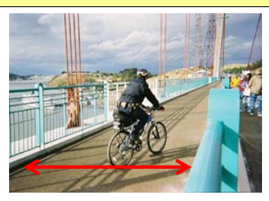
Carquinez Bridge Vallejo, CA

10' shared-use path (1 full-time) 10' (5' clear) bike path (weekend) 1' raised above roadway Total 10' (15' weekend)