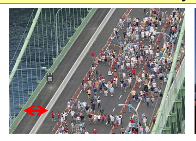
Tacoma Narrows Bridge Tacoma, WA