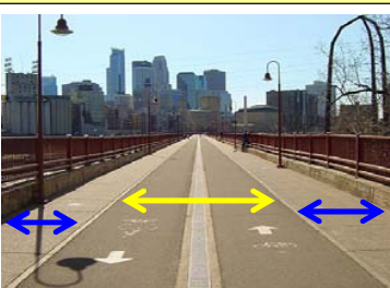
Stone Arch Bridge Minneapolis, MN

6' sidewalks (2) 6' bike lanes (2) Total: 24'