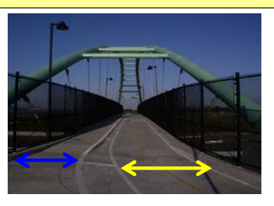
I-80 Ped/Bike Bridge Berkeley, CA

Bi-directional bike path (1) Sidewalks (2) Total: 24'