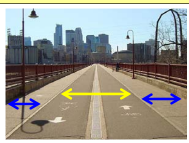
Stone Arch Bridge Minneapolis, MN

6' sidewalks (2) 6' bike lanes (2) Total: 24'