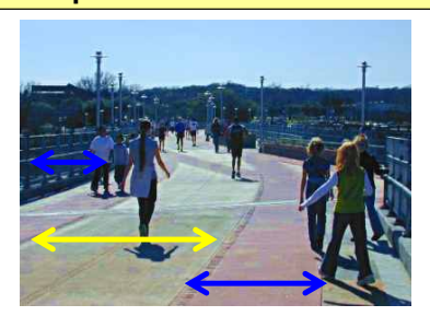
Pfluger Bridge Austin, TX

10' bi-directional bike path (1) 5' sidewalks (2) 15' observation deck Total: 20'