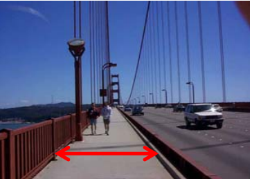
Golden Gate Bridge San Francisco, CA

10' shared-use path (1 full-time) 10' (5' clear) bike path (weekend) 1' raised above roadway Total 10' (15' weekend)