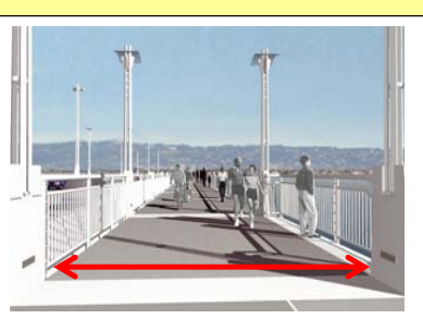
New Bay Bridge SF/Oakland, CA

15.5' shared-used path (1) 7.5' belvederes (2) Total 15.5'