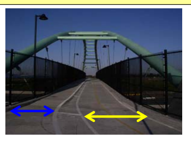
I-80 Ped/Bike Bridge Berkeley, CA

Bi-directional bike path (1) Sidewalks (2) Total: 24'