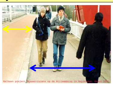
Willemsbrug Rotterdam, Netherlands

10' bi-directional bike path (1) 5' sidewalks (2) 15' observation deck Total: 20'