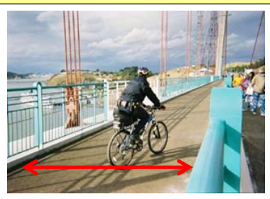
Carquinez Bridge Vallejo, CA

10' shared-use path (1 full-time) 10' (5' clear) bike path (weekend) 1' raised above roadway Total 10' (15' weekend)