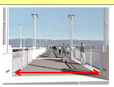
New Bay Bridge SF/Oakland, CA

15.5' shared-used path (1) 7.5' belvederes (2) Total 15.5'