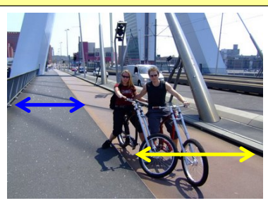
Eramusbrug Rotterdam, Netherlands

6' sidewalks (2) 6' bike lanes (2) Total: 24'