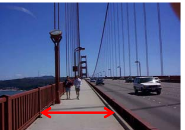
Golden Gate Bridge San Francisco, CA

10' shared-use path (1 full-time) 10' (5' clear) bike path (weekend) 1' raised above roadway Total 10' (15' weekend)