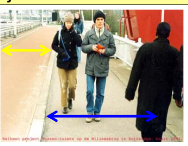
Willemsbrug Rotterdam, Netherlands

10' bi-directional bike path (1) 5' sidewalks (2) 15' observation deck Total: 20'