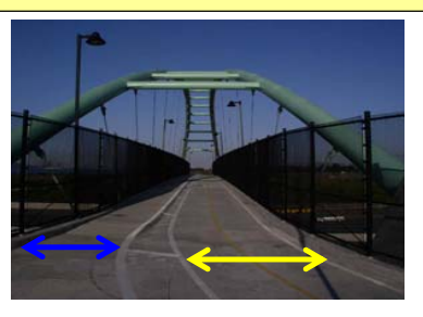
I-80 Ped/Bike Bridge Berkeley, CA

Bi-directional bike path (1) Sidewalks (2) Total: 24'