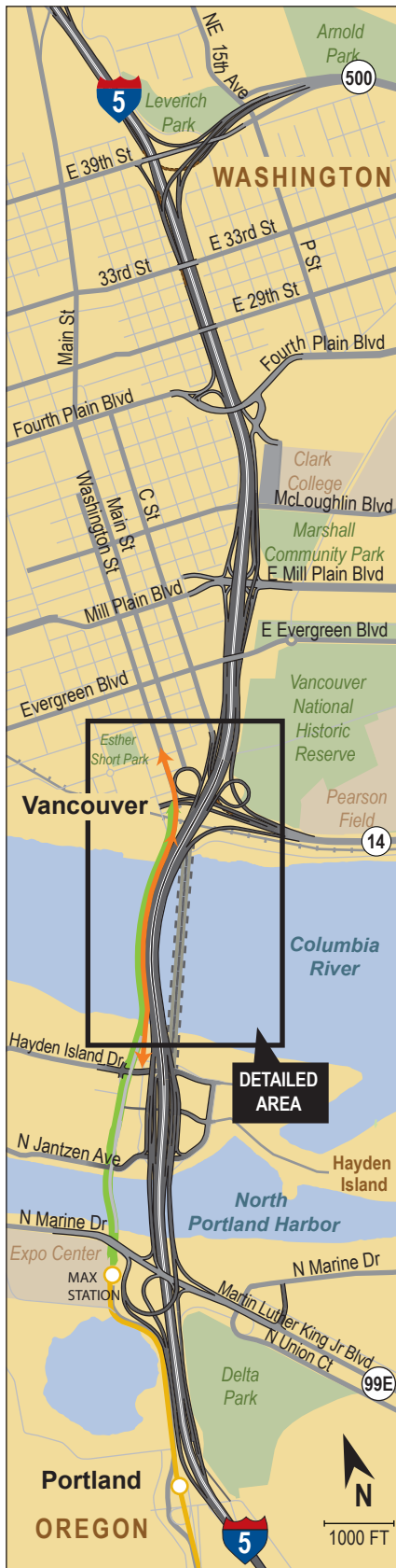
DIMENSIONS ARE APPROXIMATE.