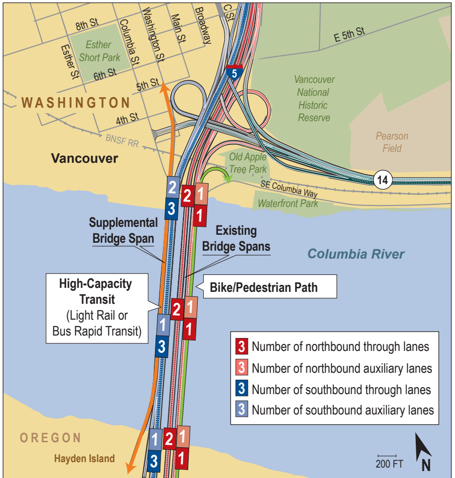
200 FT N