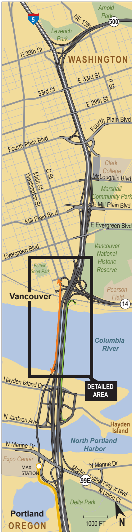
DIMENSIONS ARE APPROXIMATE.