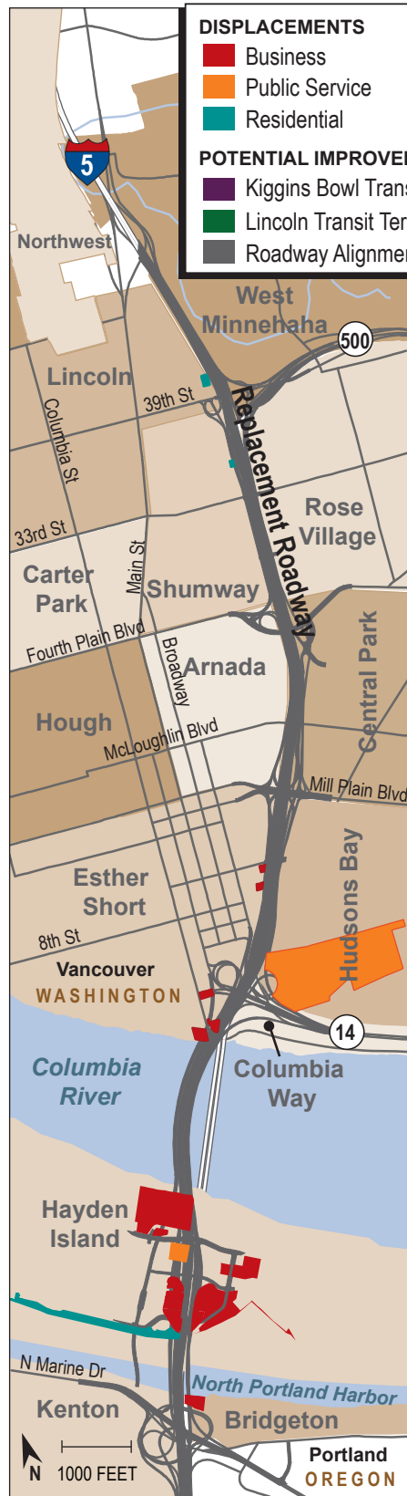
Displacements Caused by Replacement Roadway