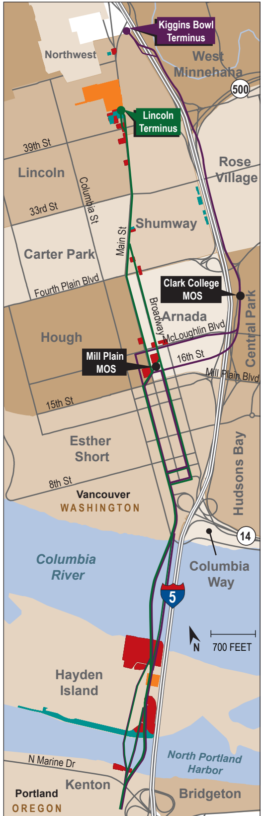
Displacements Caused by Transit Terminus Options