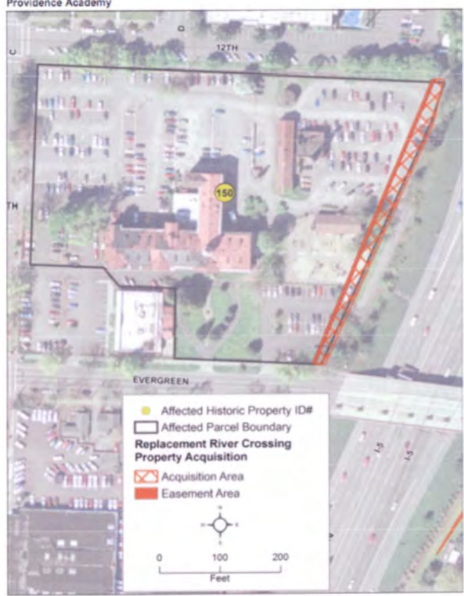
Exhibit 5.3-10 Providence Academy

Providence Academy, 400 E Evergreen Street – Alternatives 2 and 3 (the replacement crossing) would require acquisition of 0.27 acre of the eastern edge of the parcel containing this eligible historic resource, as illustrated in Exhibit 5.3-10. The land that would be acquired is adjacent to 1-5 and contains parking spaces and landscaping. Highway construction would not remove any historic or non-historic buildings from the site.