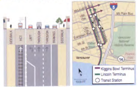
CONCEPTUAL DESIGNS / DIMENSIONS ARE APPROXIMATE

Downtown Vancouver, Washington-Broadway Couplet Transit Alignment Option