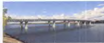
Deck-truss' 12 piers

For comparison and background information, the CRC's previous LPA design with 12 piers required 2 near-shore cofferdams and 1224 temporary piles. Pile-driving would go on over 7 months per year for 6 years per the BiologicalOpinion. (Endangered Species Act Section 7 Biological Opinion, January 29, 2011, p. 6) Impact-driving would be limited to one hour per day, up to 142 days total so it would be a few days per month. Vibratory pile driving could go on any time during the year.