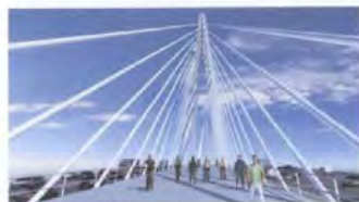
Cable-stayed bike pedestrian path

A commitment the CRC has made to the community is the bike facility will be World-Class. ( CRC Pedestrian and Bicycle Advisory Committee (PBAC) memorandum to Columbia River Crossing Task Force, June 17, 2008 ) The bike community expects that commitment to be honored. The cable-stayed bridge type honors that commitment the best.