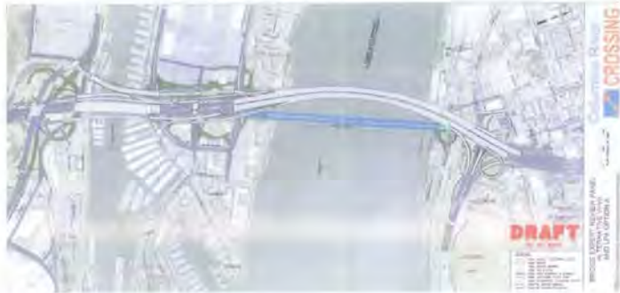
Build a Better Bridge Faster White Paper March 11, 2011