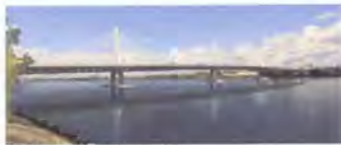
Cable-stayed's three piers

With footprint compacted into only three piers (vs. 10-12), the cable-stayed bridge most likely requires fewer temporary construction piles, reducing pile-driving noise and vibration impacts on fish and nearby neighborhoods.